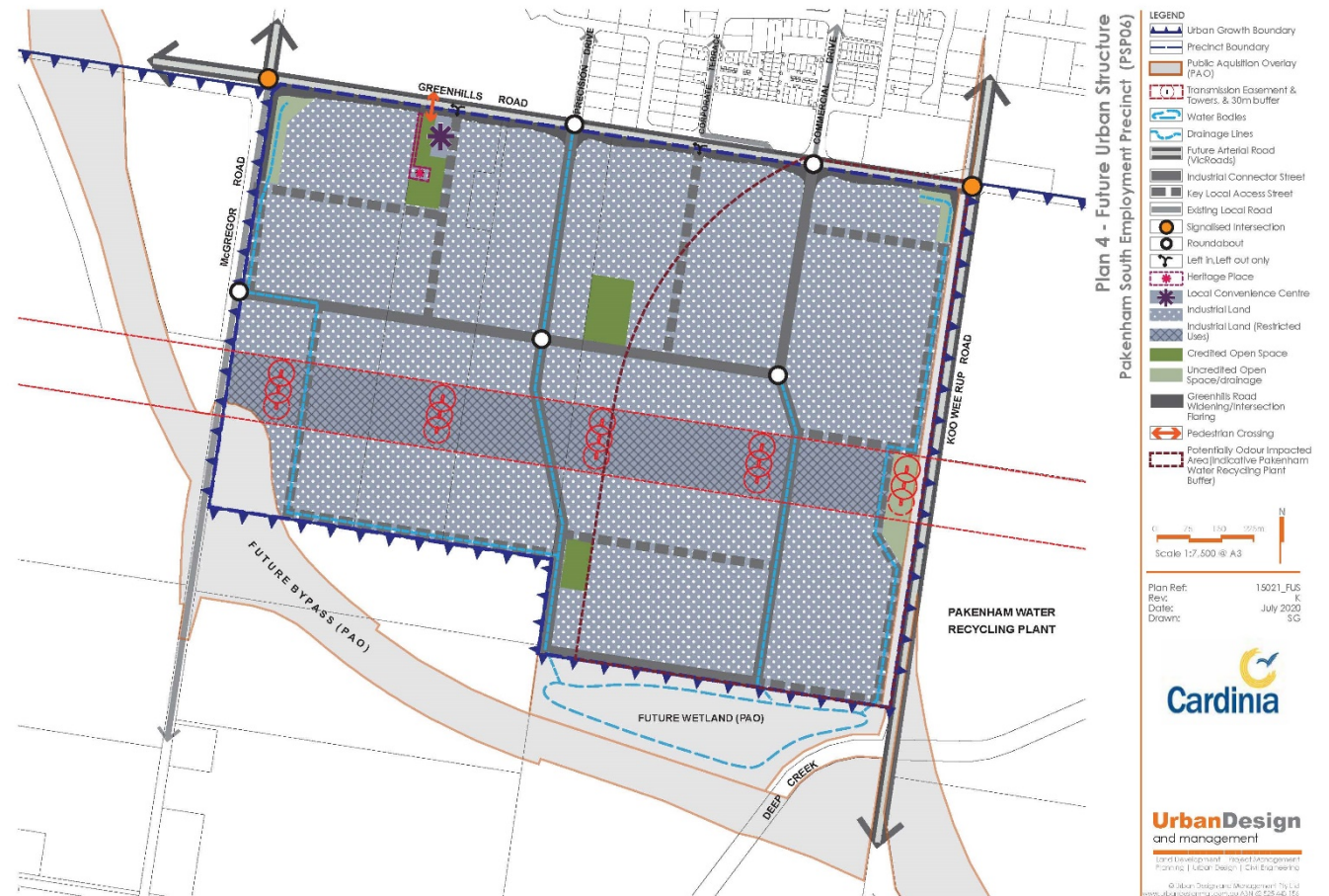
Figure 2: Pakenham South Employment PSP – Future Urban Structure

Specific updates to the Cardinia Planning Scheme proposed for Amendment C265 are outlined in the exhibition documentation.