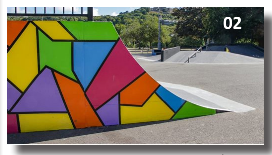
Proposed art work on vertical ramp surface