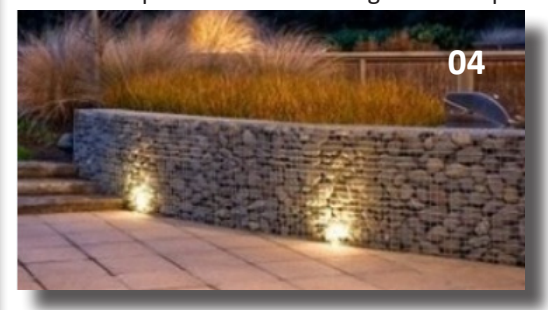
Gabion wall entrance feature