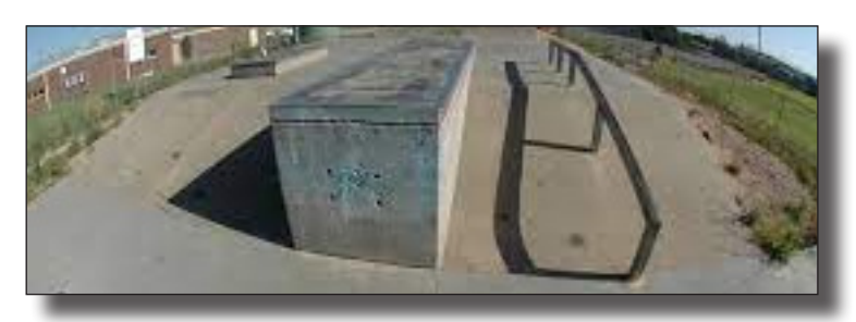
East facing view at Garfield Skate Park.