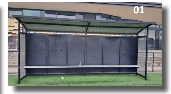
Stations proposed on either side of the ramps with proposed art work on the exposed panel