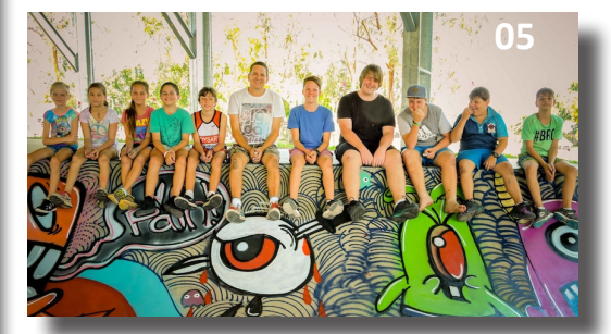
Proposed art work on skate ramps with community initiatives.