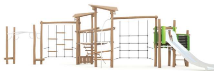
2 - Activity panel